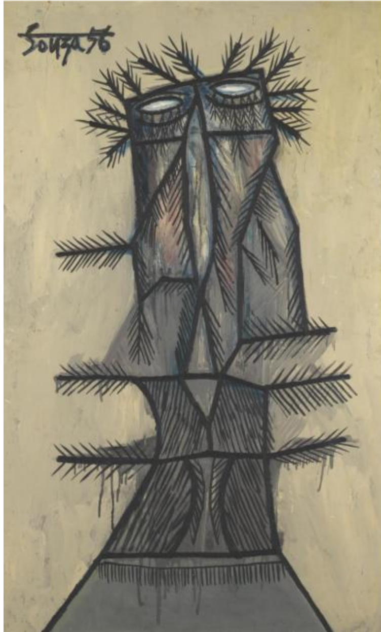
F. N. Souza, Christ on Palm Sunday , 1956, Oil on board, 48 x 30 in.