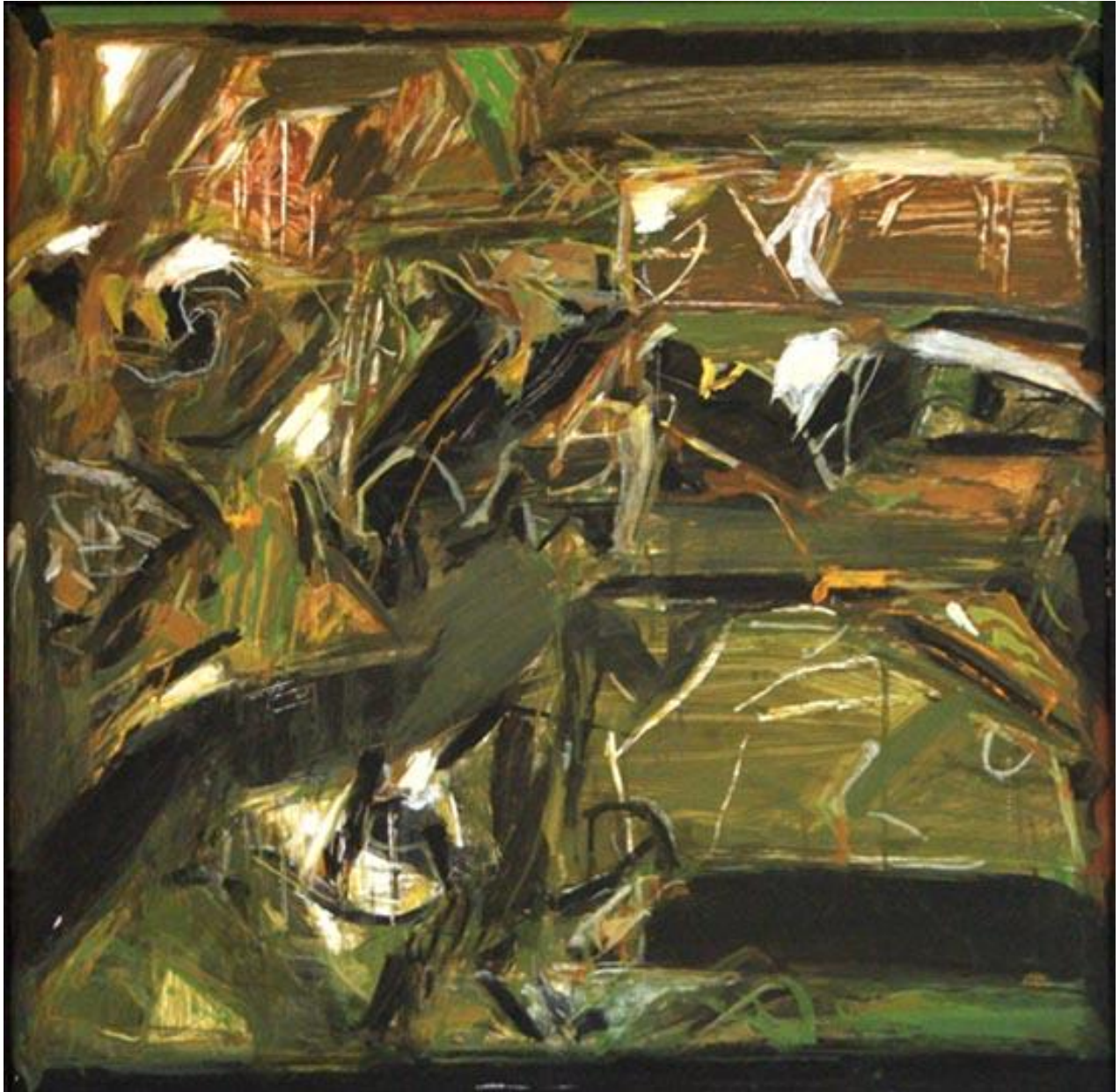
S. H. Raza, Untitled Abstract , ND, Acrylic on card, 31.5 x 31.5 in.