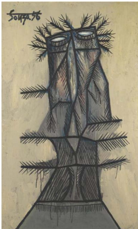
F. N. Souza, Christ on Palm Sunday , 1956, Oil on board, 48 x 30 in.

35 Great Jones Street, New York, NY 10012