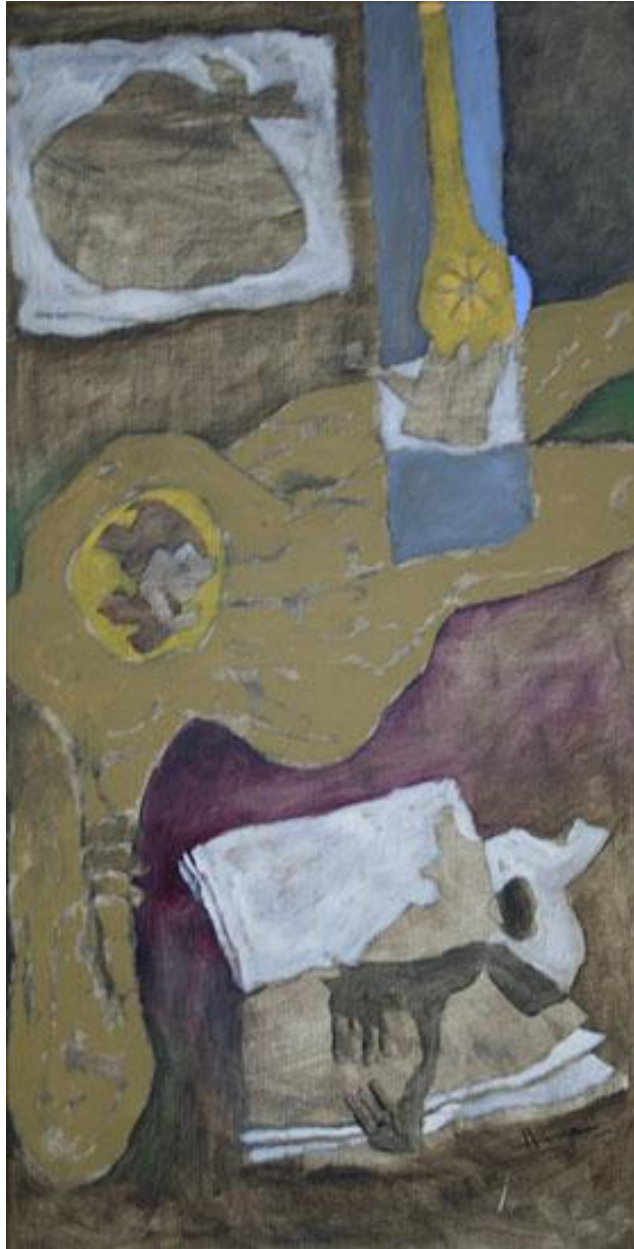
M. F. Husain, Autobiography V , 1996, Acrylic on canvas, 47 x 23 in.