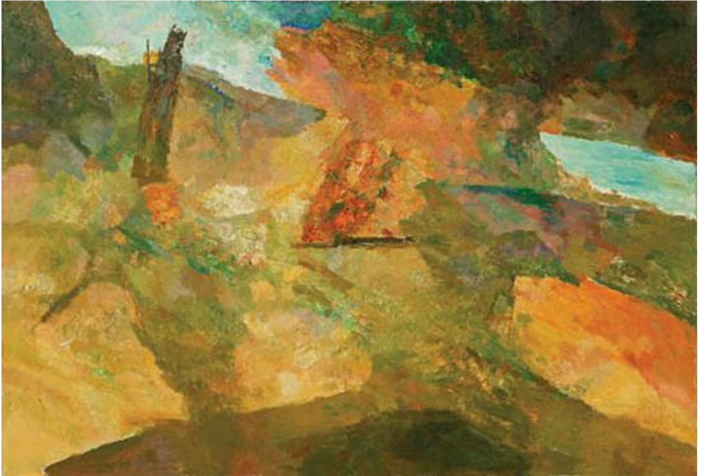
Ram Kumar, Abstract Landscape 17 , 2002, Oil on canvas, 48 x 72 in.