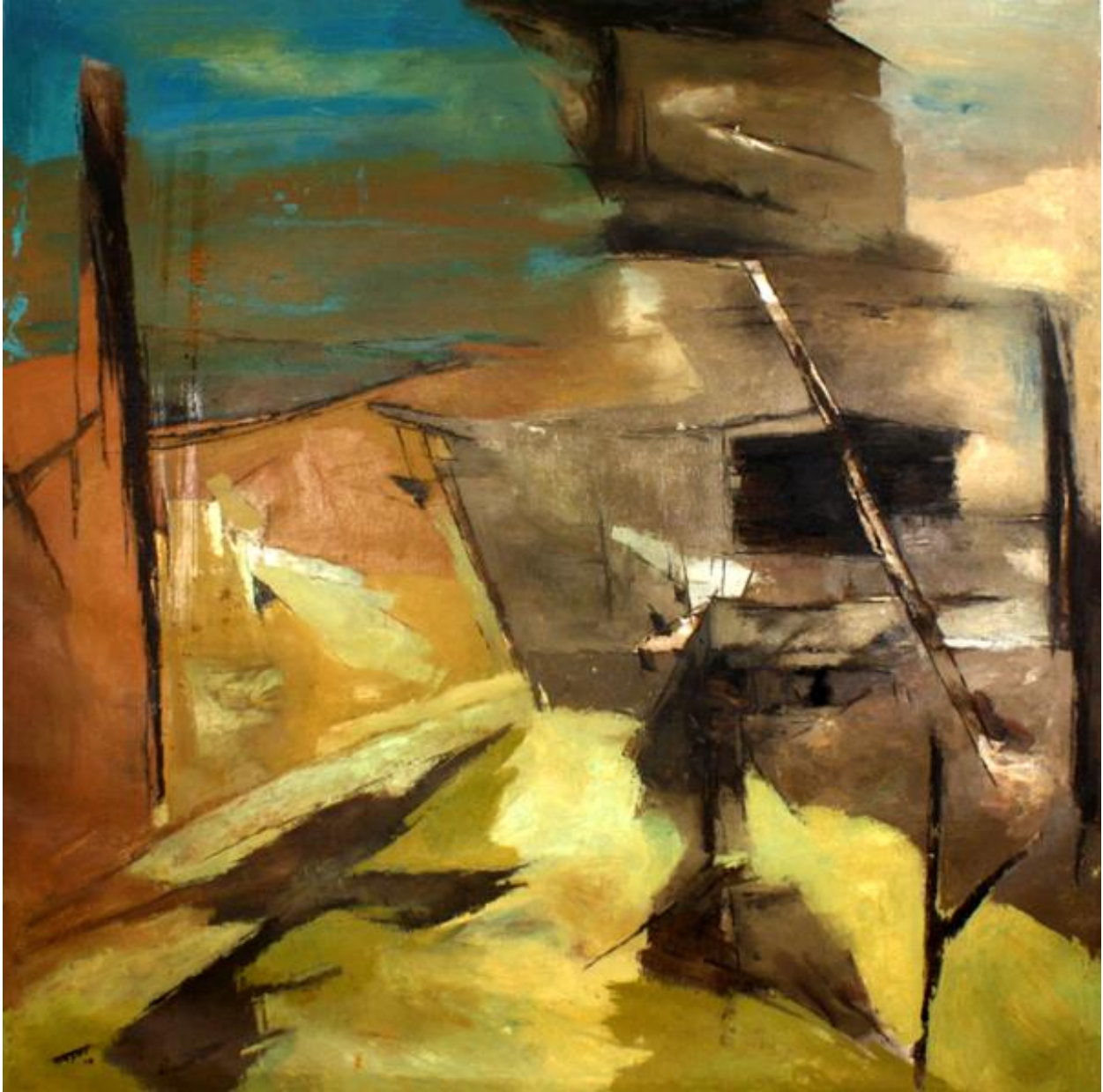
Ram Kumar, Untitled Abstract , 1970, Oil on canvas, 50 x 50 in.