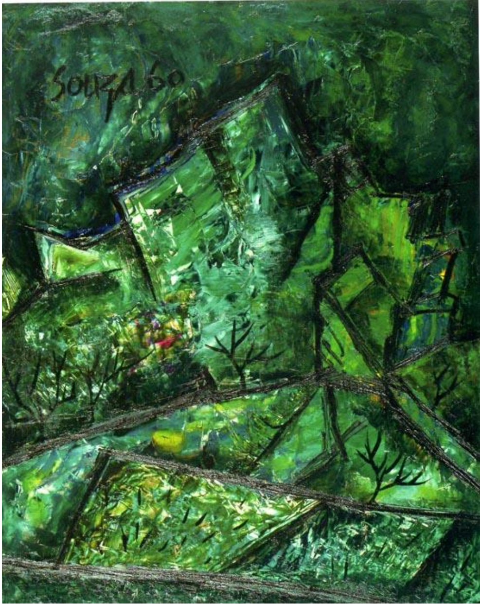
F. N. Souza, Green Landscape , 1960, Oil on board, 30 x 24 in.