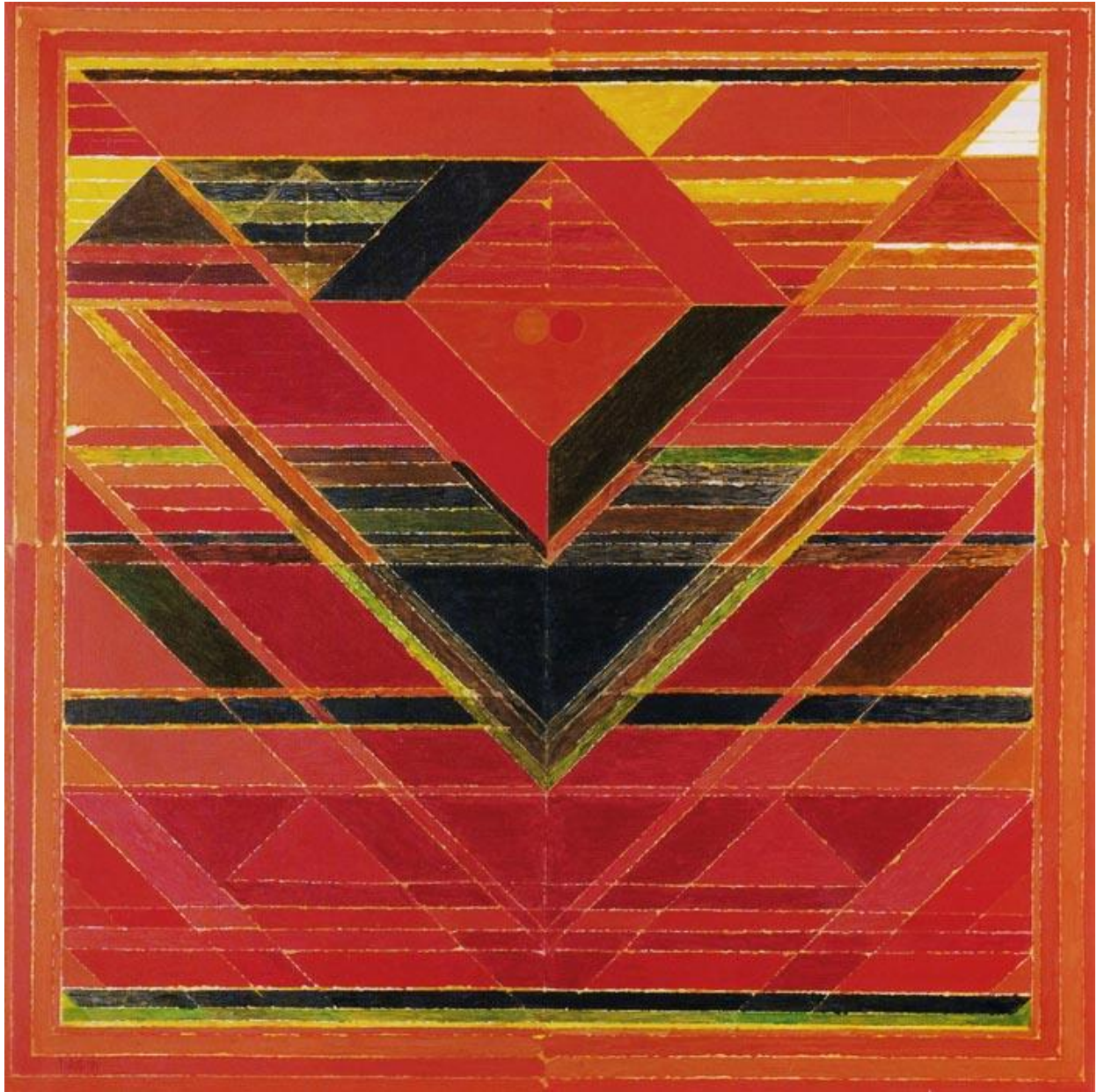
S. H. Raza, Nad Bindu, Fertilité , 1988, Acrylic on canvas, 31.5 x 31.5 in.