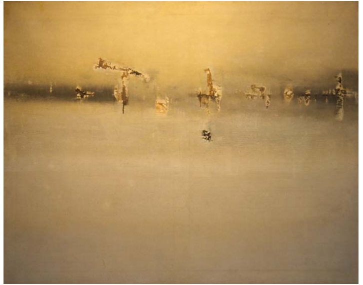
Vasudeo Gaitonde, Painting No. 3 , 1962, Oil on canvas, 40 x 50 in.

An iconoclast known for his powerful imagery and the Group's main ideologue, F. N. Souza's unrestrained graphic style and uncompromising vision created much controversy surrounding his life and work. His repertoire of subjects covers still life, landscape, nudes and icons of Christianity, rendered boldly in a frenzied distortion of form. Souza's works express defiance and impatience with convention and the banality of everyday life. A recurrent theme in his work is sexual tensions and conflict within male-female relationships.