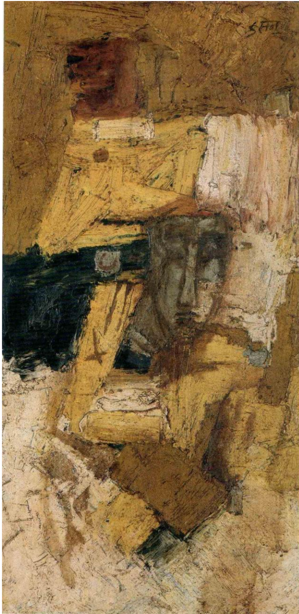
M. F. Husain, The Mirage 1960, Oil on board, 48 x 30 in.