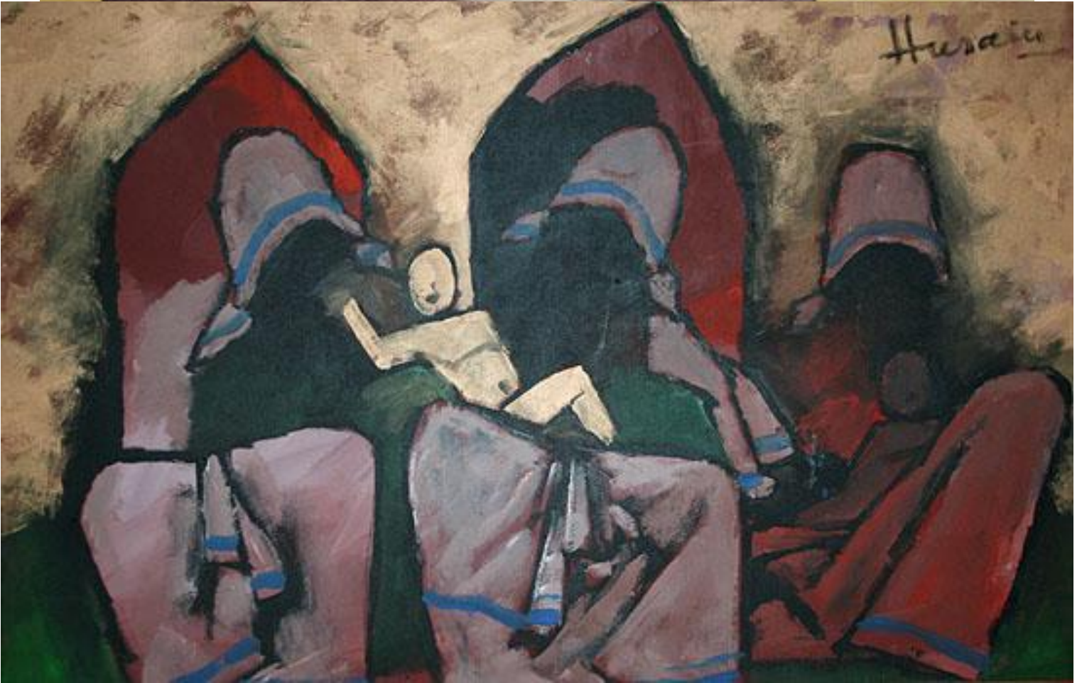
M. F. Husain, Mother Theresa , ND, Oil on canvas, 37.5 x 60 in.