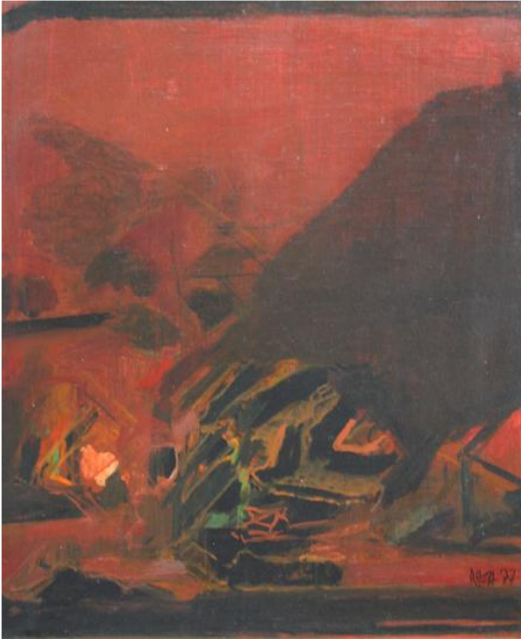
S. H. Raza, Untitled (Brown Abstraction) , 1977, Oil on canvas, 16 x 13 in.