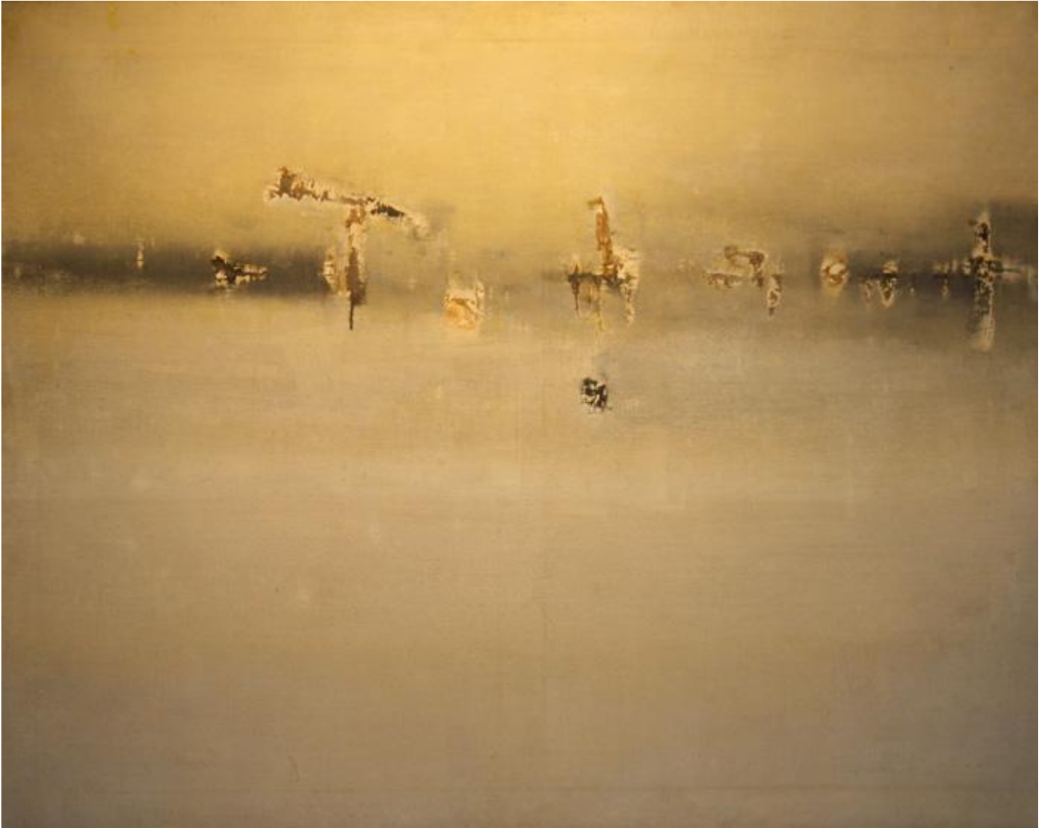
Vasudeo Gaitonde, Painting No. 3 , 1962, Oil on canvas, 40 x 50 in.